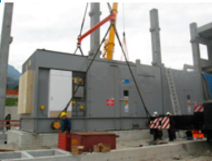
2. Installation of Gas Turbine