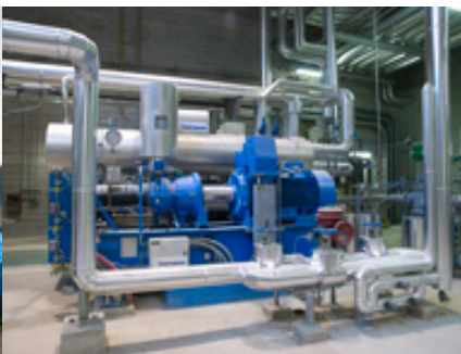
5. Friotherm heat pump