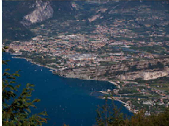
7. Riva del Garda View