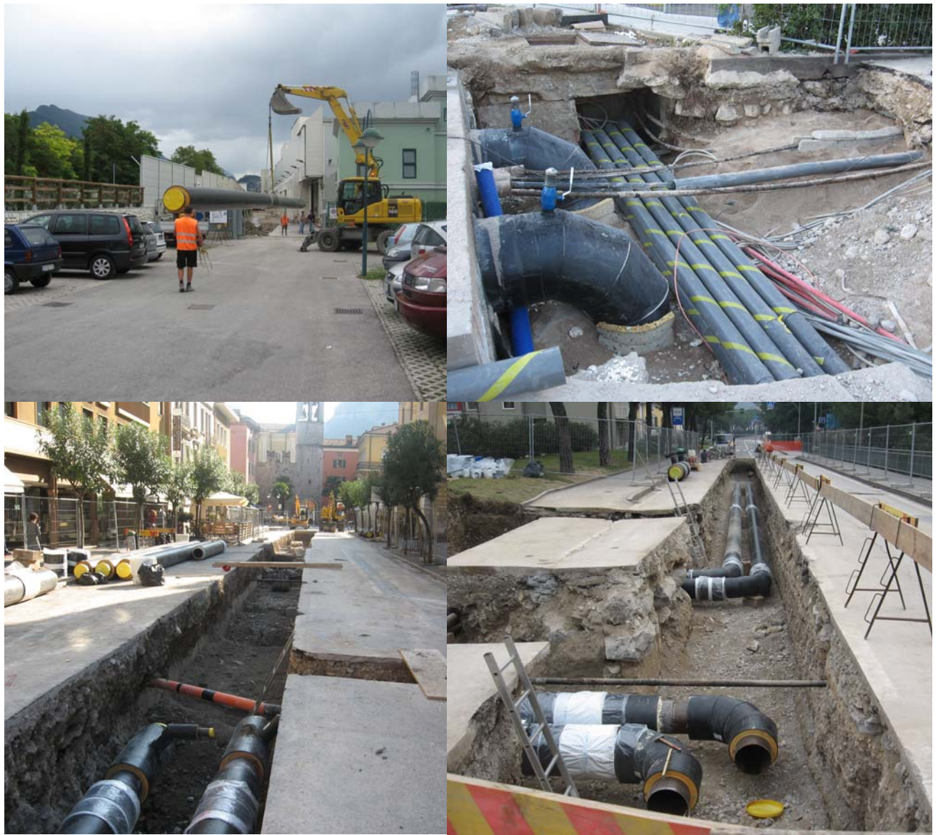
Constuction of the District Heating Grid