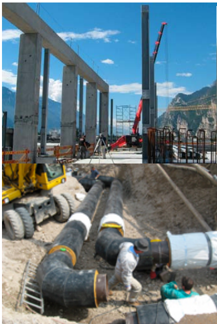
1. Erection of the Power Plant (July 2008)

The realization of the initiative has benefited of a clear commitment from the local authorities. The main obstacle, at the beginning of the project, was represented by the an uncertain potential customers acceptance. However, this problem has been overcome due to the good technical performances of the system and the good economic conditions offered for the delivery of the heat services.