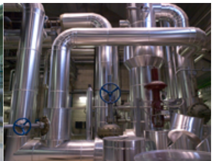
6. District Heating section