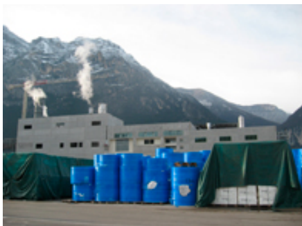
4. Cogeneration Plant start up (December 2008)